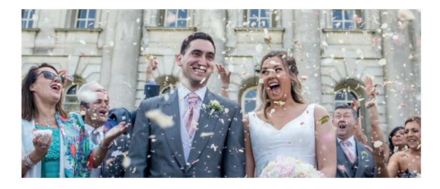
*the above packages are based on minimum of 80 people on Saturdays and Sunday, we can offer bespoke packages for numbers less than 80, please contact us for your tailored package*