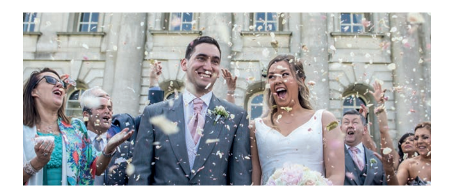
*the above packages are based on minimum of 80 people on Saturdays and Sunday, we can offer bespoke packages for numbers less than 80, please contact us for your tailored package*